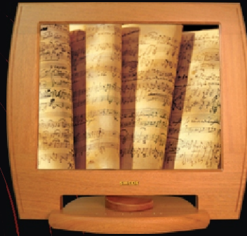
Model ID: XV1-19AV-SP1