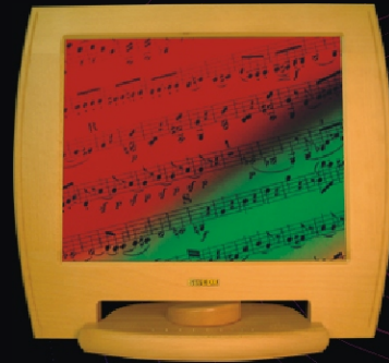
Model ID: XV1-19AV-BE1