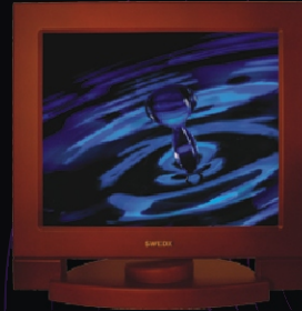
Model ID: XV1-15-BE3