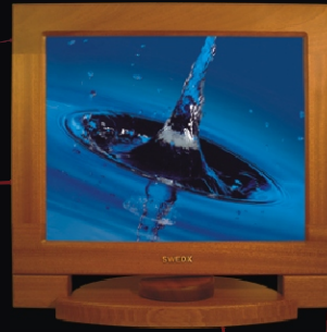
Model ID: XV1-17-SP1