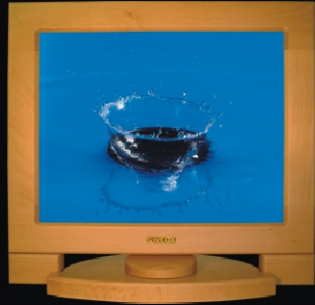
Model ID: XV1-17-BE1