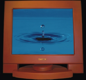
Model ID: XV1-15-BE2